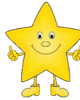
Willow Rowan Elm Beech